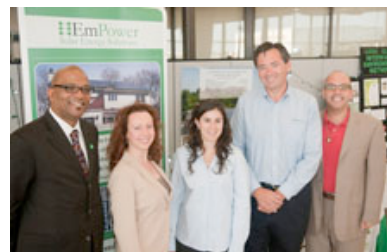
LIEN co-chairs and ACT say "thank you" to our sponsor Empower Solar!

Remember to look for L.E.D. holiday lights this season! They use 90% less energy than standard bulbs!