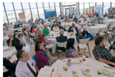
A full room!